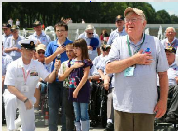
A special ceremony for all veterans at the World War II Memorial