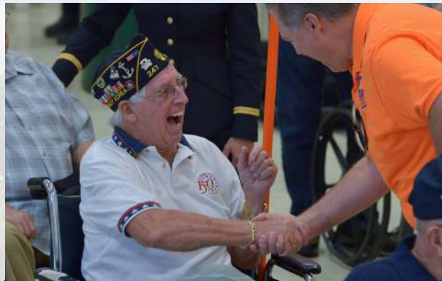
Starting the day at Chicago's Midway International Airport