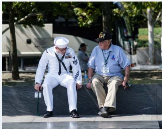
The afternoon is spent at the Korean War Memorial, Vietnam War Memorial, Lincoln Memorial and the Udvar-Hazy Center