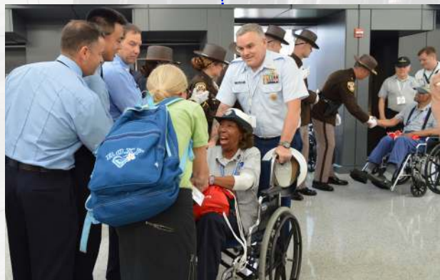
Veterans are greeted by more than 100 volunteers in Washington, D.C.