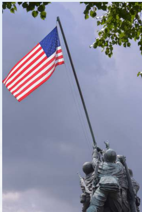
Tours of the Marine Corps War Memorial and the Air Force Memorial