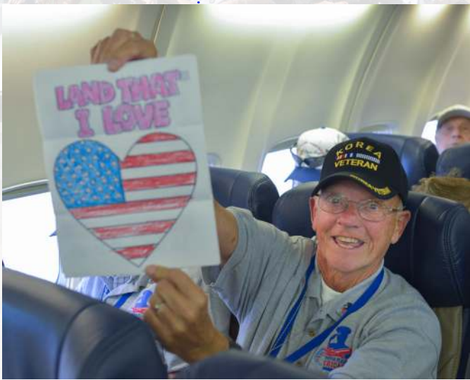
Mail Call on the flight back to Chicago, when each veteran receives at least 50 letters from loved ones and strangers