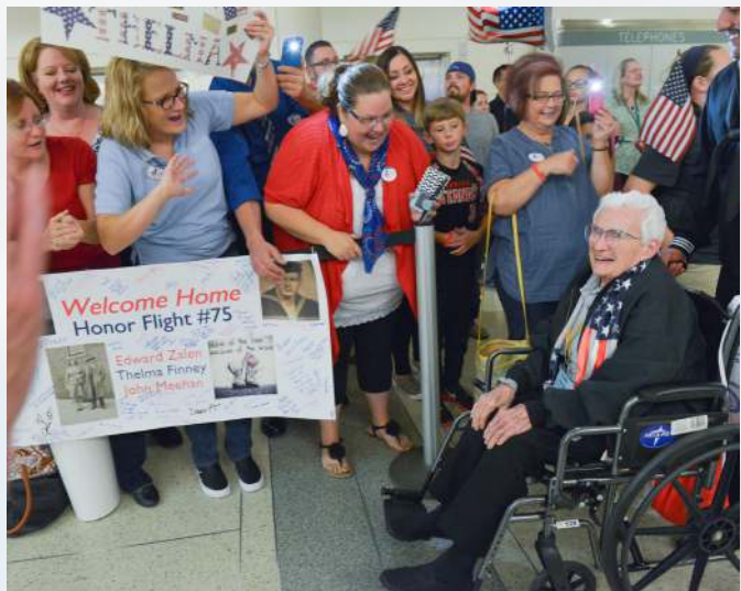
The day ends with a Welcome Home celebration of a lifetime as thousands of people line the hallways at Midway to welcome their heroes home